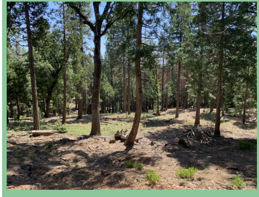
Example of an effectively implemented shaded fuel break prescription (Martell District).