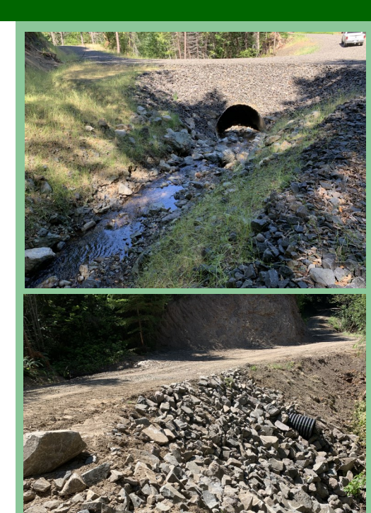
Sierra Pacific Industries employs a variety of sediment control measures to protect water quality in its road building and crossing installation operations, including liberal use of well placed rip rap (Oregon District).