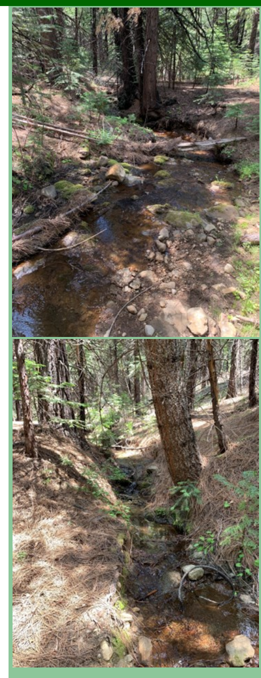
Example of a Class 2 stream being effectively protected by a 50 foot WLPZ (Watercourse and Lake Protection Zone) (Martel District).